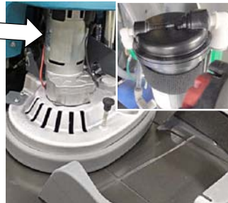
T5, T5e, Speed Scrub