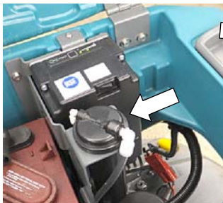
T300/e, Speed Scrub 300, A300